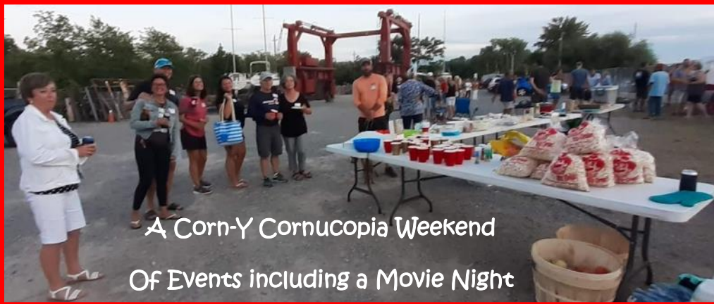
A Corn-Y Cornucopia Weekend Of Events including a Movie Night